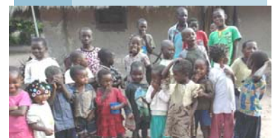
A Group of Sponsored Children